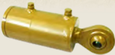
203060 HVST 310