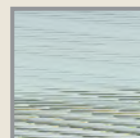
Bushes & Washers

Call now to find out more information on the application that suits your needs.