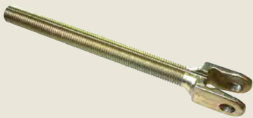
203495 Yoke Rod