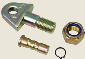
Fork Rod Kit