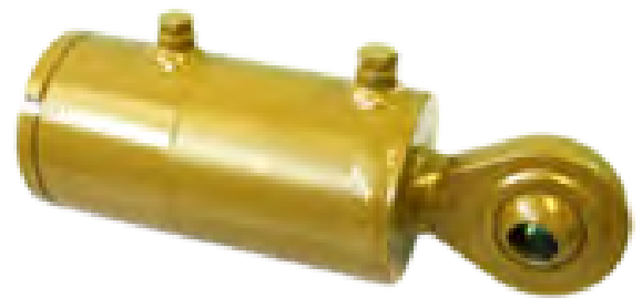
203060 HVST 310 HYD Side Shift Cylinder