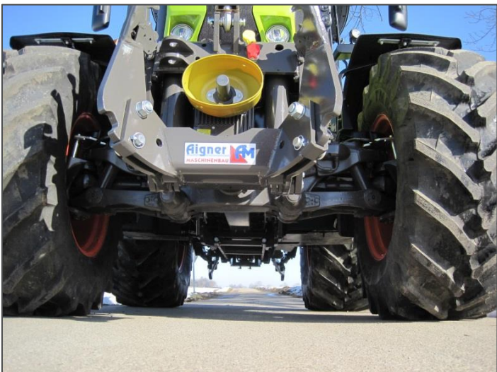
Absolute ground clearance