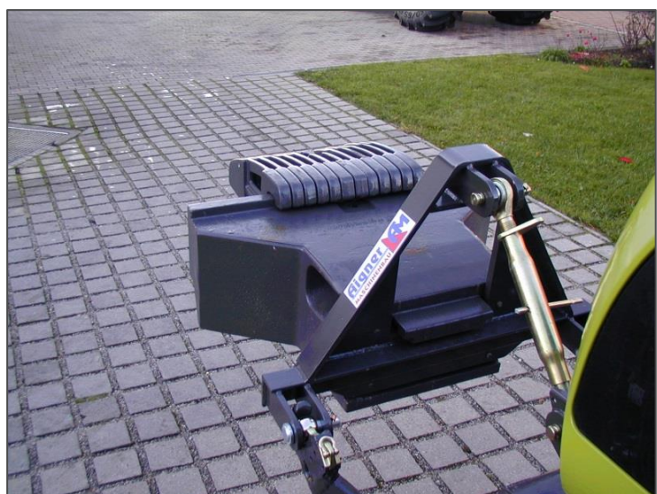
Supporting frame for tractor basic weight – 3-point attachment or for coupling triangle