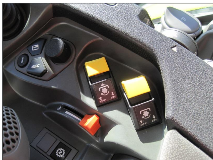
Switched on by push button