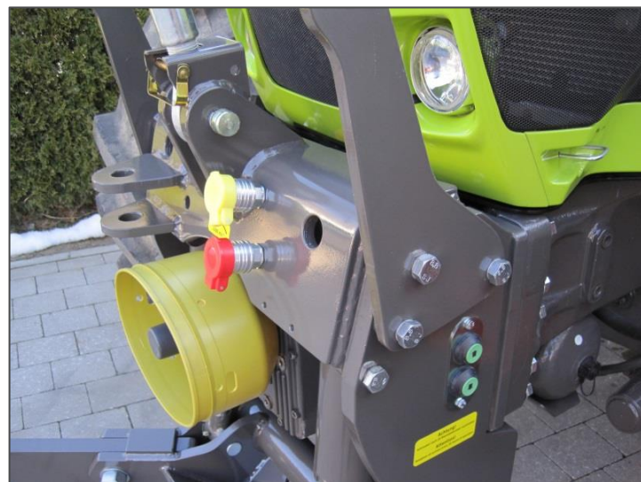
Front Linkage and PTO is a compact unit– integrated hydraulic connections