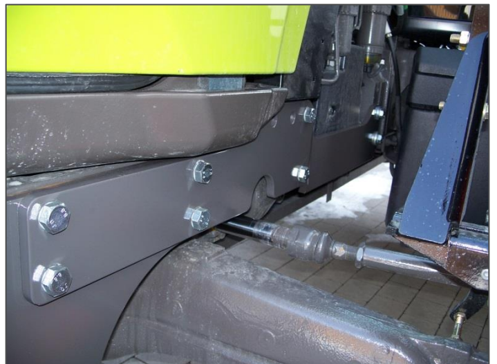
Stable frame up to clutch housing – Uninhibited front axle oscillation and steering angle