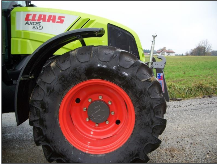
Completely integrated system