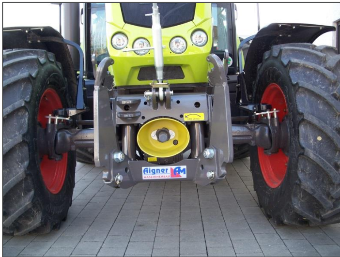
Lower links fold inward diagonally