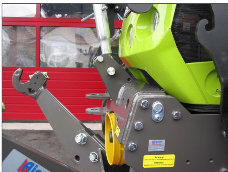
Holder for top link