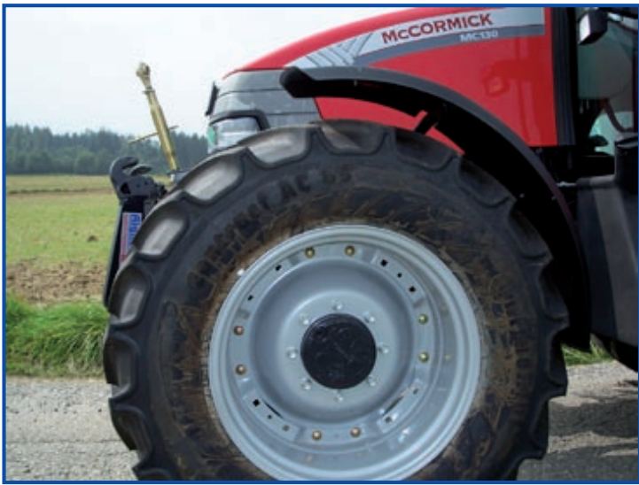
Completely integrated system