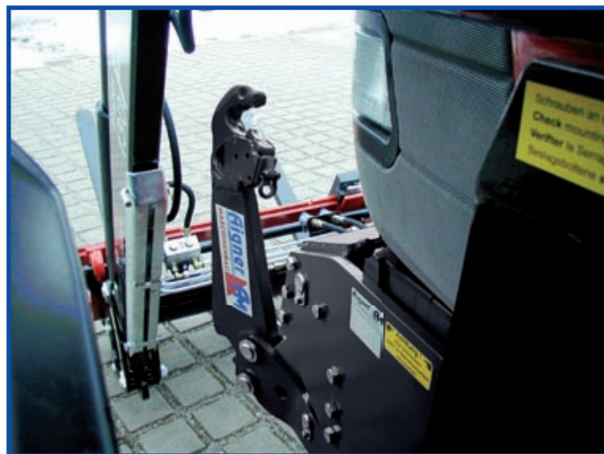
Optimally co-ordinated also for the combination Front linkage + Front loader!