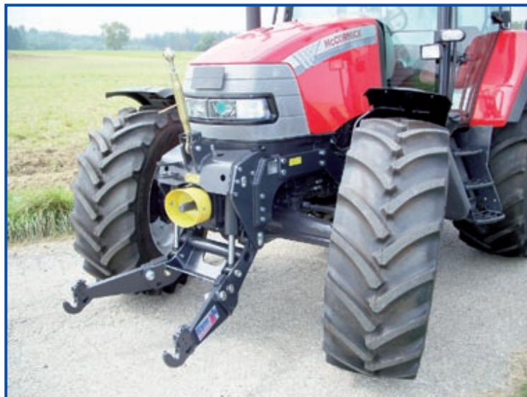
Front linkage and PTO are a compact unit