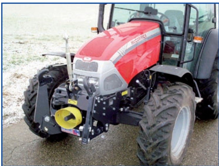
Holder for top link - standard for all types