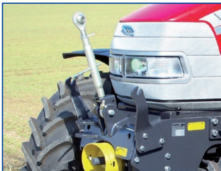
Brackets for mower relief springs