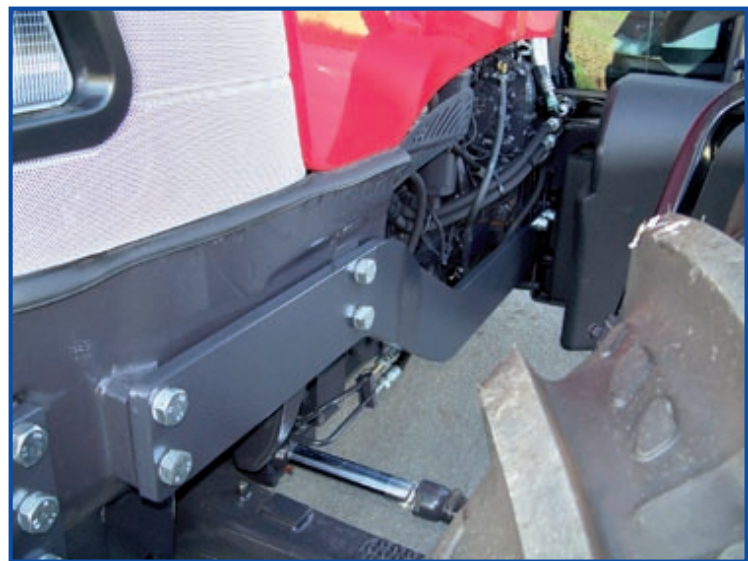
Stable frame up to clutch housing – Uninhibited front axle oscillation