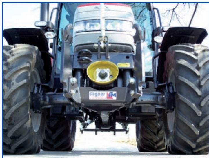
Absolute ground clearance!