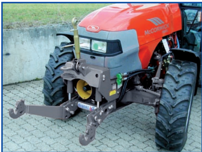
Available for all series – also for tractors of the F-series!