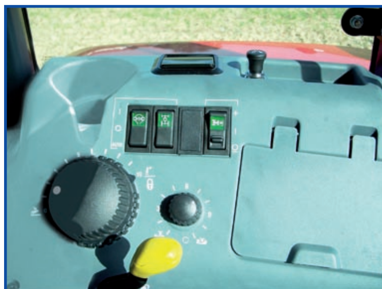
Switch – on by a push-button