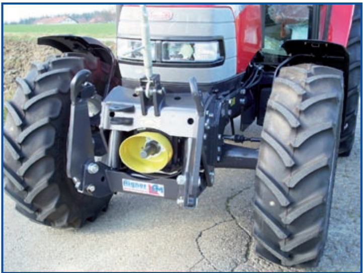
Lower links fold inward diagonally